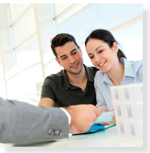
Rent Collection Experienced Guidance